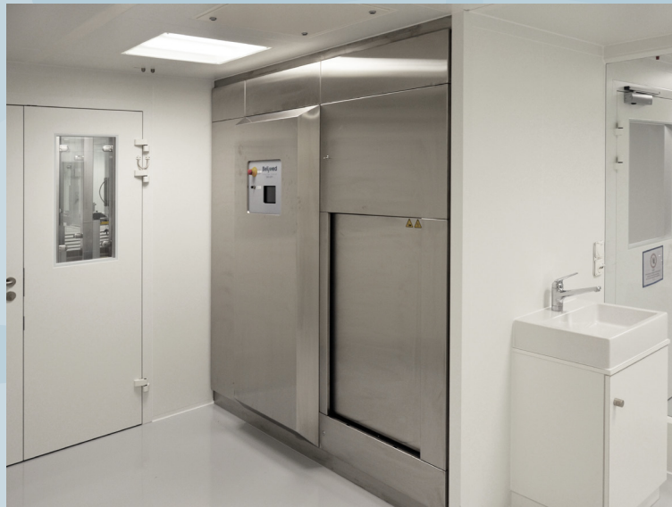
Our new Belimed steam sterilizer.

The sterilizer has been produced in Switzerland using high quality materials and components by the renowned Belimed Company. The machine is designed to disinfect both solid and porous products such as filters, rubber stoppers, and system components. The sterile filters are regularly disinfected in order to avoid cross-contamination. An automated integrity test monitors each of the filters to make sure they are operating correctly. It is a reliable GMP-compliant design.