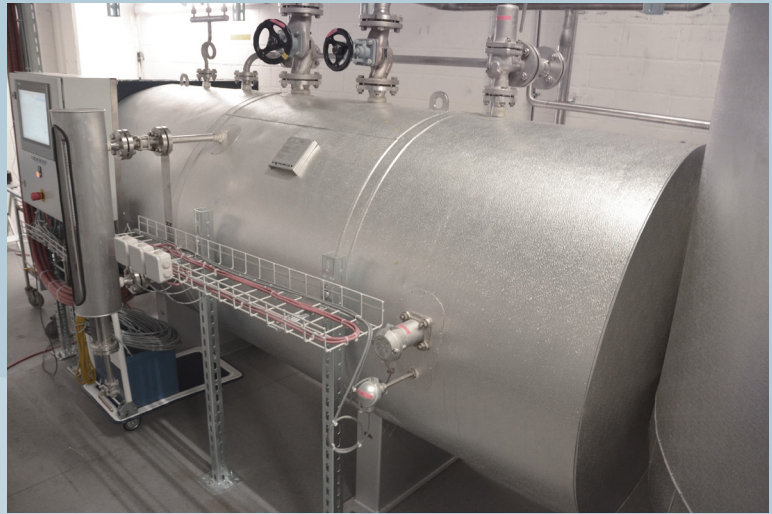
Our brand new electric steam generator reduces our carbon footprint.

The steam has multiple purposes within the manufacturing process. It is connected to the Clean-in-Place / Sterilize-in-Place (CIP/ SIP) systems, the sterilizer and it is also used to produce WFI.