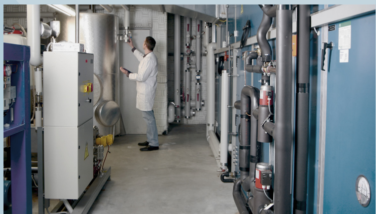
Our engineers regularly monitor the water quality.

We monitor and certify our water quality. This is done using various methods such as recording pH as well as determining osmolality measurements, conductivity, and endotoxin and bioburden levels.