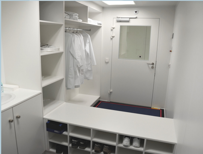
The main entrance to the liquid media plant.

The cleanroom has been constructed to be as large as needed but as small as possible in order to increase its sustainability and efficiency. Wide windows have been installed to give the plant a sense of space and increase the staff's ability to communicate throughout the facilities.