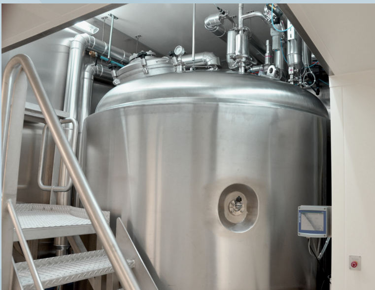
Our 5,000 L media tank is electro polished to meet pharmaceutical standards.

“Our capacity to produce and ship large orders in a reliable and sustainable manner has substantially increased.”