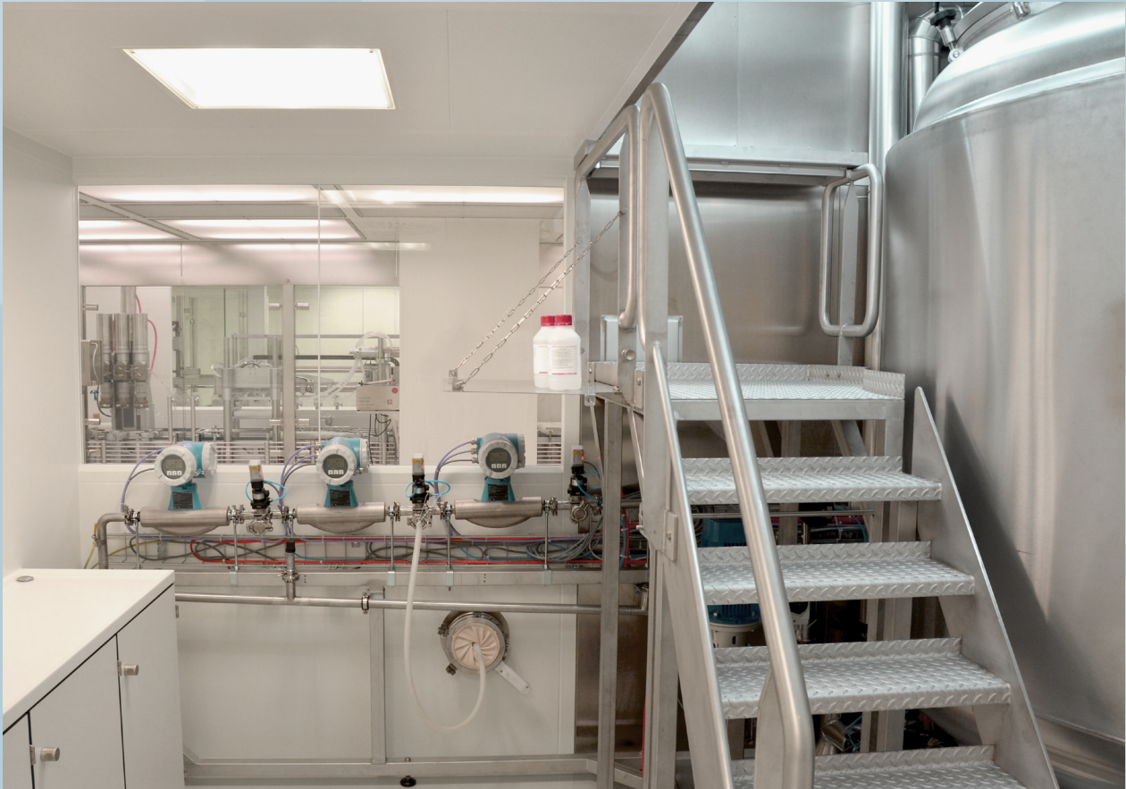
Three brand new media filling points. The large windows between rooms allows staff to communicate with ease.

The three new media filling stations can handle up to three 500 L containers simultaneously. This allows us to complete even big batch sizes within one day. The media pipes are made out of pharmaceutical standard stainless steel and are linked to the CIP/SIP system.