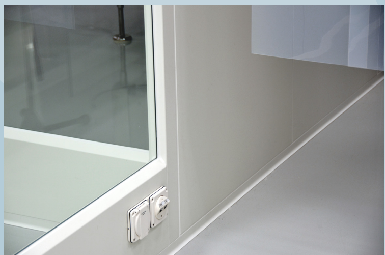
The interior is made out of materials such as glass, synthetic resin and stainless steel.

The materials used to build the interior and furniture are sleek, waterproof and are in accordance to GMP standards. We have used stainless steel, HPL, glass and synthetic resin to create such conditions. The materials have the advantage of being easy to clean, thereby minimalizing contamination, and providing an appealing working environment for the staff.